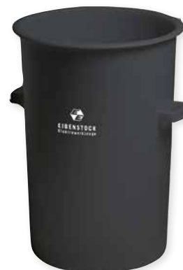
mixing tub 326110

full sweep mixer paddle no unmixed pockets in tub corners