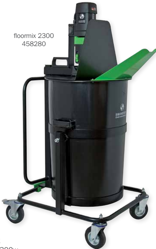
floormix 2300 458280

FloorMix Power 2300w Speed 1 130rpm Speed 2 280rpm Machine weight 48kg Capacity 100kg Noise level 67dBA Voltage 110 or 230v